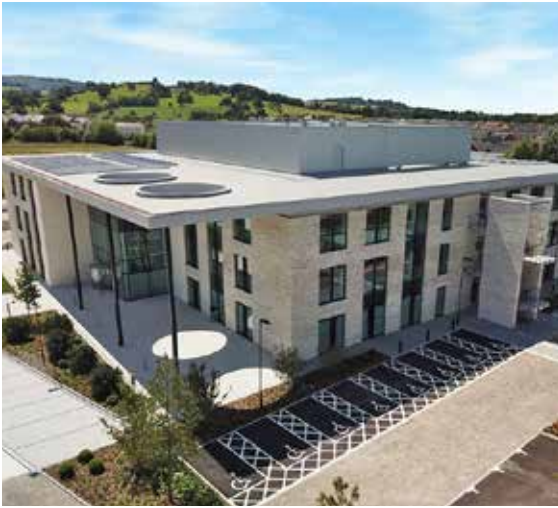
Ecclesiastical's office in Gloucester

Ecclesiastical Planning Services works with funeral directors across the country. It is part of the Benefact Group which is a family of award-winning, specialist financial services businesses that, from its profits, gives to good causes in order to transform lives and communities.